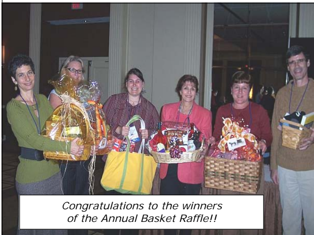
Congratulations to the winners of the Annual Basket Raffle!!