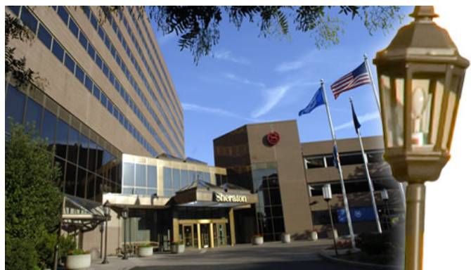
The Hotel Entrance

Hotel conference rates are available through September 29, 2008. The conference rates are $117/night for a single, $127/night for a double, $137/night for a triple, and $147/night for a quad. Parking is available in the hotel's attached parking garage at a reduced fee of $5.00 per vehicle per night for registered hotel guests. The hotel is wheelchair/disability accessible.